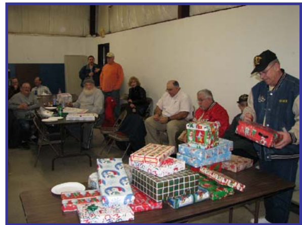
A fine time was had by all!

We didn't have a white Christmas, but we did have a beautiful sunrise Christmas morning. This picture was taken in Elbridge.