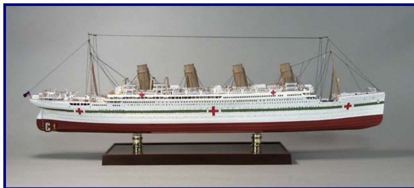
HMS Britannica from Syrcon 19